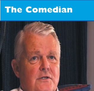
Mark Thomas Stand-Up Comedian