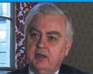
Lord Lamont Former Chancellor of the Exchequer

HEAD OF CITIZENSHIP/ MODERN STUDIES Visit our website for other titles www.team-video.co.uk